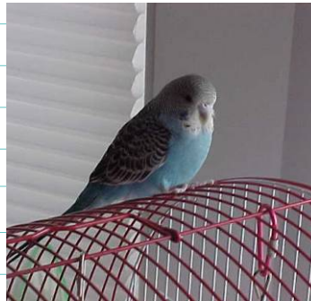
CC is resting on top of his cage after a climbing adventure.

All the new and old pets behave well. Now, I am not sure if we will get more ferrets, birds, geckos, or any other pets.