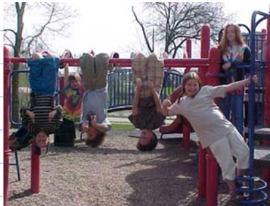
ABOVE: These are some of the ASK students at the park. They are having fun playing on the equipment.

I am happy that the weather is nice. So we can go to the park.