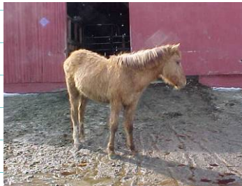
Lilly is enjoying the weather as she stares into our back pasture.

Have you ever been picked on? Kotah seems to pick on Lilly sometimes. Since Lilly has been pushed around for months, she is getting older, bigger.... And tougher, so she's starting to push Kotah around! If he messes with her, Kotah sometimes gets a hoof sandwich. But, he usually doesn't mess with her.