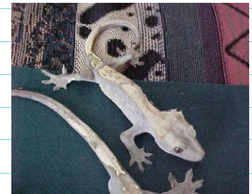
Quantum is taking a walk on the futon.