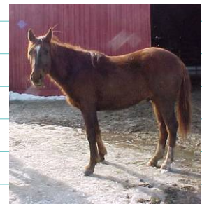
Kotah is having a good time standing in the puddles and snow. He might just drink out of the puddles.