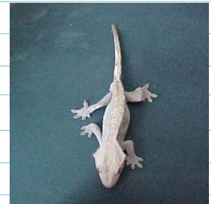
Funny Feet is joining Quantum on his walk on the futon.