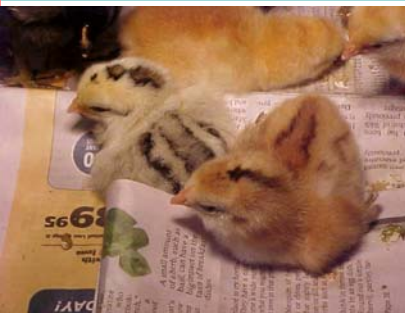
This is Hawkeye and Furball. Two of our ten chicks.

The temperature has to stay at 100 degrees. I think hatching chickens is a lot of fun.