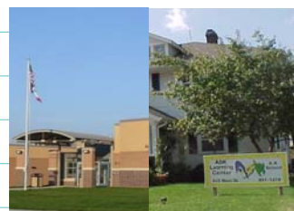
The two schools merged. I did this myself, using my know how from Eastveiw.

Look at the time! I need to split like an apple. That isn't right. I need to split like a banana. Is that right? While I try to get my metaphors right, why don't you go on and read the other articles.