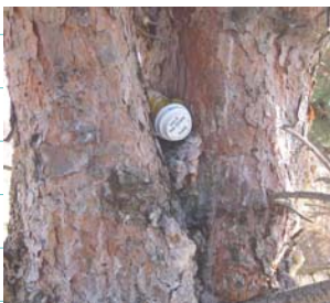
This is a picture of a tree with a GEOCACH in the tree and they are pretty small that's why you look very hard.