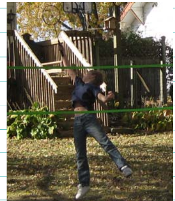
This is me about to hit the birdie.

I really enjoy badminton. It's really fun and you get better coordination! Some students think it's good exercise! And all students agree it's pretty awesome!