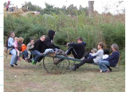
This is some of the kids trying to get the teeter-totter level.

There are fun things to do at the pumpkin patch. There is a cool thing for the parents and that is a gift shop. It's in the white barn. There are two levels and there is a lot of stuff. Get this the pumpkin patch is also a tree farm.