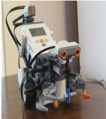
This is what a finished Trio Bot looks like. It took me tow and a half hours to build this. When it is done you can start to program the robot.